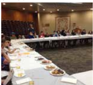
Tu B'Shevot Seder