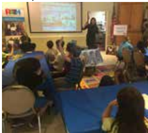
Ohr L'Olam PATH

Our next teen event is March 6th. We are inviting in IDF Soldiers, a Krav Maga Team and a team from Omega Securities. Our teens will learn about IDF and how they are trained utilizing Krav Maga. They will experience a hands-on Krav Maga class learning both verbal and physical techniques, all while learning about self defense, anti-bullying techniques and self empowerment. Our teens will also meet with an American Security team who gets most of their intelligence from Israel and learn to apply day to day safety tips for High School and even for college.