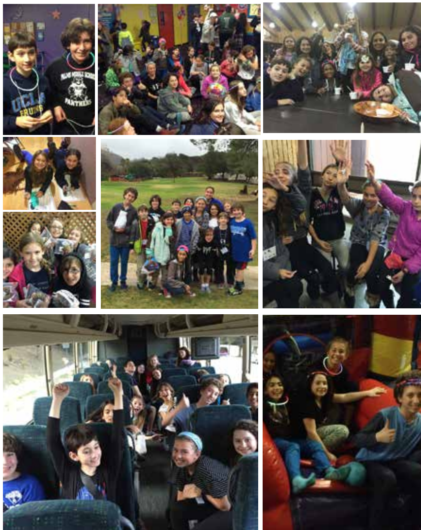
Kadimaniks having a blast at Camp Ramah!

Mark your calendars for Sunday, March 13th. We are going to Sky High a Trampoline Amusement Park – get ready to jump and have fun! Our Kadimaniks will carpool to Sky High in Woodland Hills; we will have two hours of unlimited jumping time, a party room reserved with pizza, drinks and desserts. Stay tuned for pictures and more info!