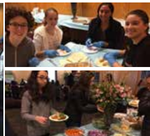
Teen event kick-off