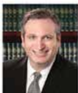
ATTORNEY AT LAW "20 years Experience"

FAMILY LAW COMMERCIAL LITIGATION FREE 30 MIN. CONSULTATION