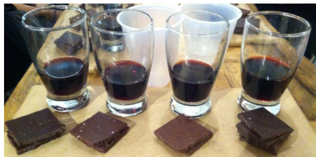
Wine and chocolate from the NextGen event at ChocoVivo. (above &amp; below)