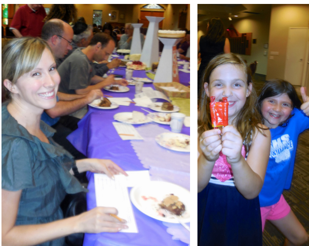
Tasting delicious cheesecake and enjoying edible Torahs at our Shavuot celebration