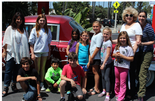
Kadima kids enjoying an afternoon of bowling

We at the Kehillat Ma'arav community strive to make an impact with our holiday programs by making them meaningful, educational, and, of course enjoyable. Hopefully word will catch on about the fun and the sweetness we carefully infuse into our programming to make these Jewish celebrations even more special! We love seeing all of our families, young and old, celebrate together and welcome you to join us.