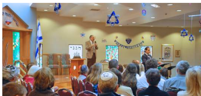
2013 Interfaith Breakfast at KM

Thanksgiving Day Thursday, November 27th 8:30am Brentwood Presbyterian Church 12000 San Vicente Boulevard Los Angeles, CA 90049