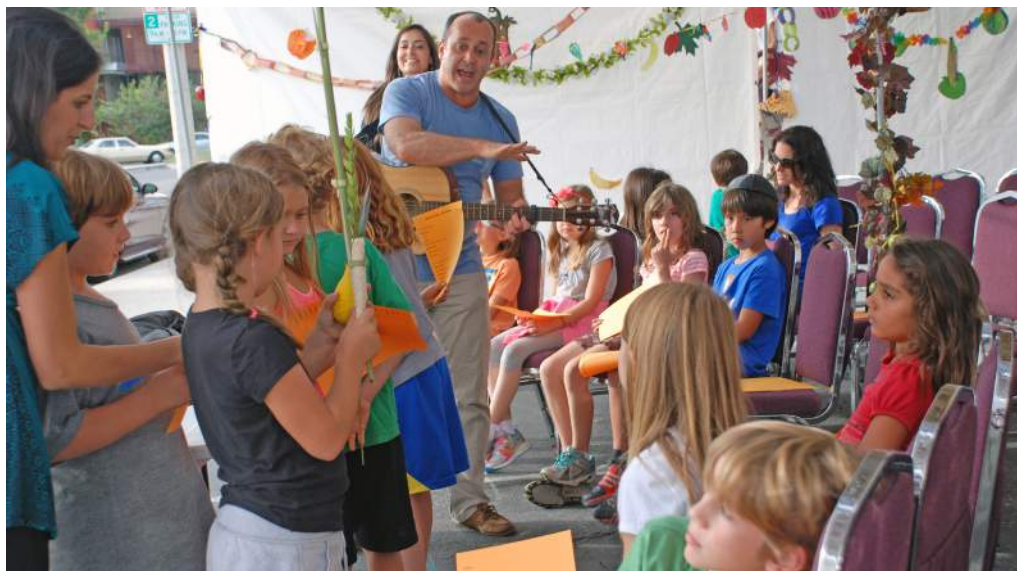
Religious School students celebrating Sukkot in the KM sukkah.