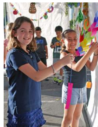
KM Students decorating and enjoying the sukkah, celebrating Simchat Torah, and making graham cracker sukkahs.