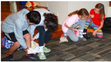
Clockwise from upper left: Bear Naming Ceremony, making edible hanukkiah, delivering Ohr L'Olam donations, candle lighting with our Religious School, Hanukkah Candle Lighting at 3rd Street Promenade, and Maccabee Training Camp at Religious School.