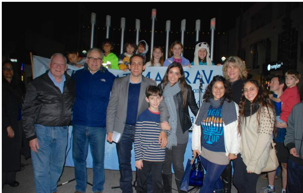
Hanukkah Candle Lighting at 3rd Street Promenade.