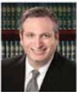
ATTORNEY AT LAW "20 years Experience"

FAMILY LAW COMMERCIAL LITIGATION FREE 30 MIN. CONSULTATION