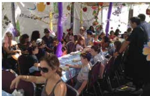
Pot Luck Lunch in the Sukkah!

Our next Ohr L'Olam event is right around the corner and I am looking forward to reporting about it next month. As a teaser, will be meeting at Adat Shalom and learning about the principles of Tzedakah and how we can implement Maimonides 8 levels of Tzedakah into our lives while performing acts of Gemillut Chasadim throughout the year at Adat Shalom and in the Greater Los Angeles community.