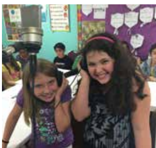
Making a Hanukkah CD