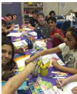
Ohr L'Olam Bikkur Cholim