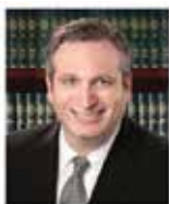
ATTORNEY AT LAW "20 years Experience"

FAMILY LAW COMMERCIAL LITIGATION FREE 30 MIN. CONSULTATION