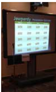
RS Hanukkah party