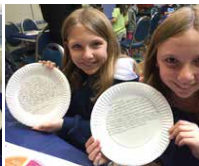
Ohr L'Olam MAZON and SOVA activities