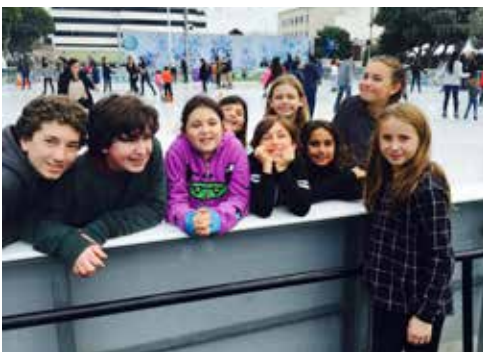
Kadimaniks having a blast at ICE in Santa Monica!